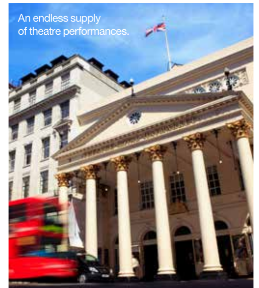
An endless supply of theatre performances.

London ranked 3rd best student city in the world QS 2017