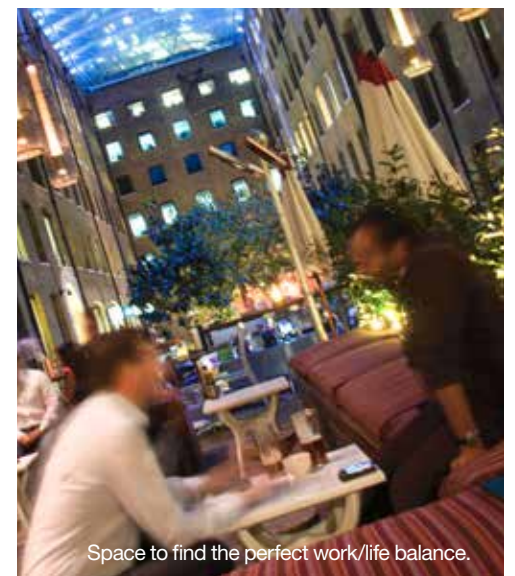
Space to find the perfect work/life balance.

London ranked 3rd best student city in the world QS 2017