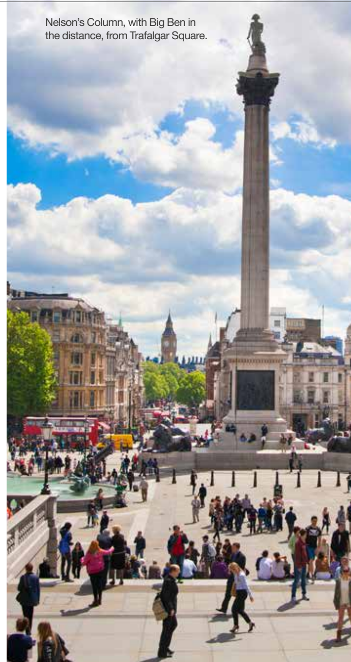
Nelson's Column, with Big Ben in the distance, from Trafalgar Square.