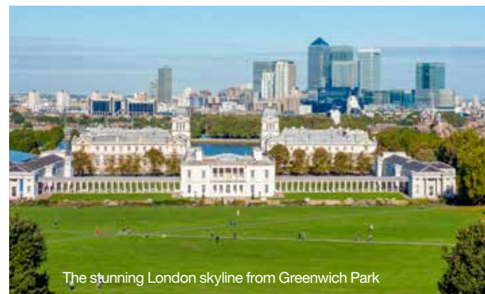
The stunning London skyline from Greenwich Park